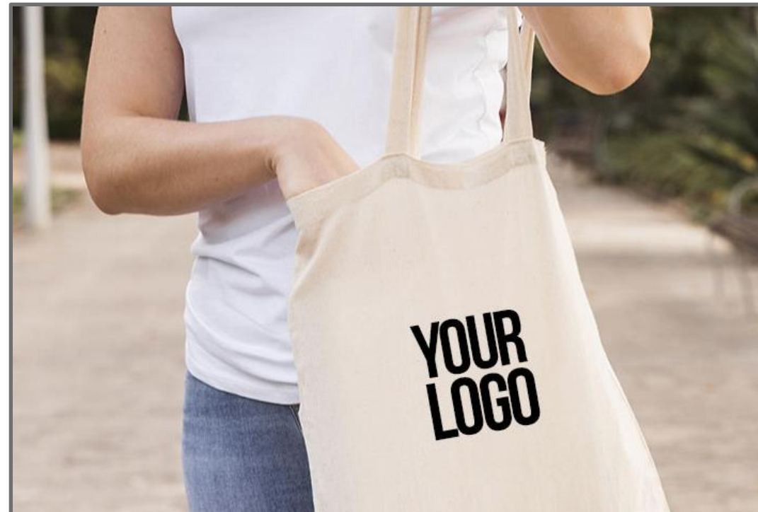
Bags* | $1,450 Sponsor Produces