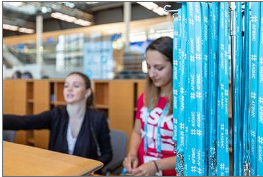
Lanyards* | $2,450 Sponsor Produces