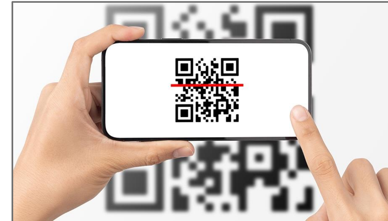
QRCode Branding | $1,450