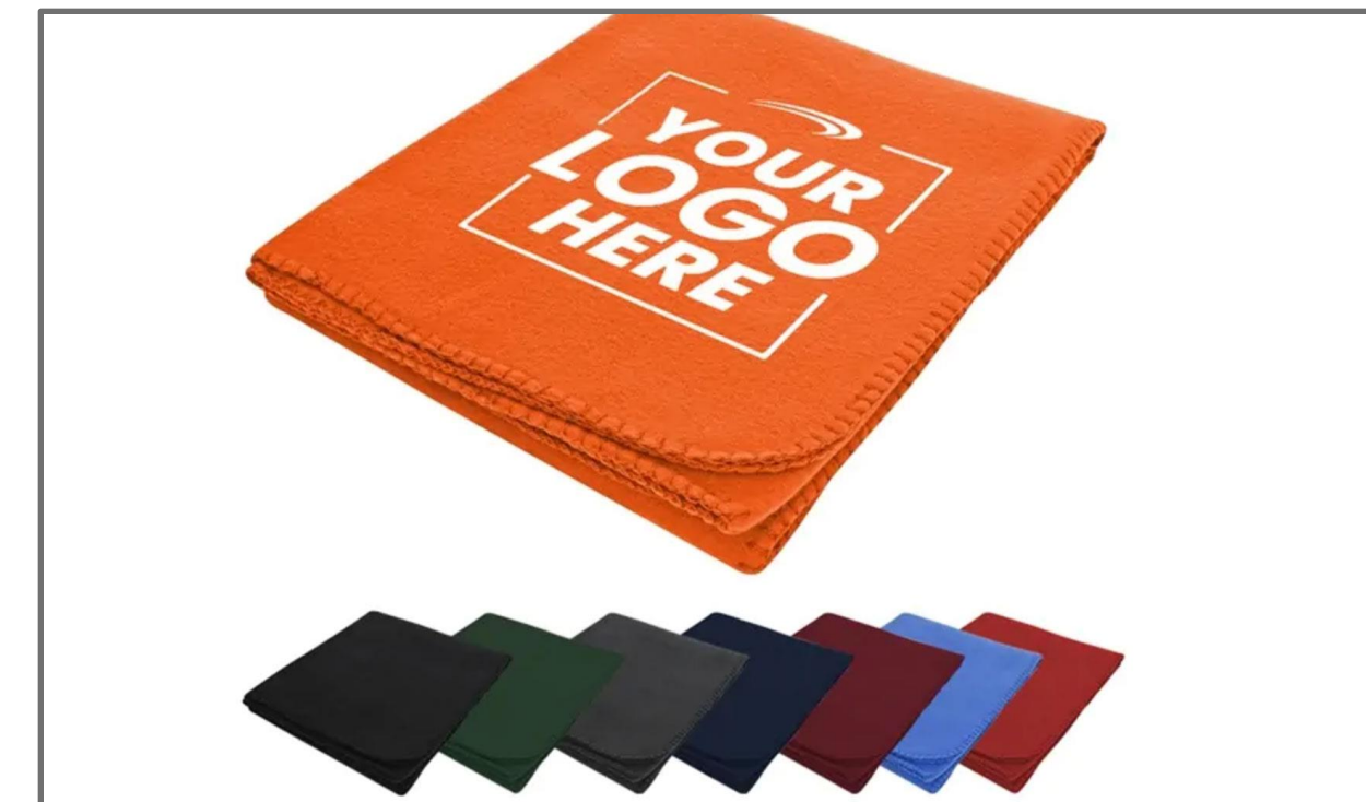
Blankets | Sponsor Produces $2,450 | RMI Produces $3,450

*Please note that the sponsor is responsible for the production and on-time delivery of the promotional material. The layout has to be agreed with Rising Media beforehand.