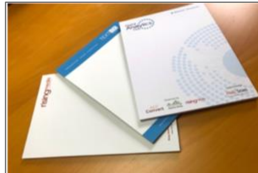
Pads & Pens* | $950 Sponsor Produces